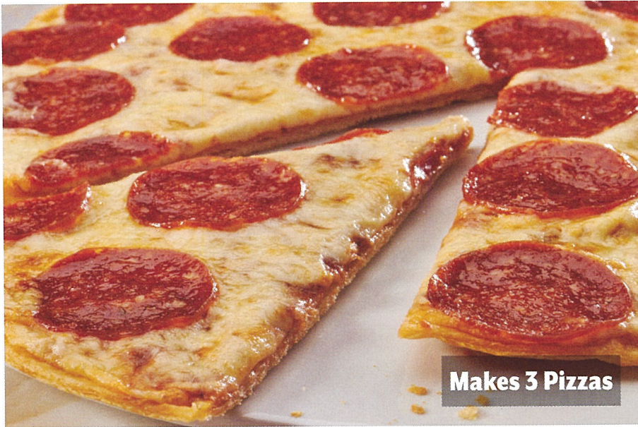
Makes 3 Pizzas