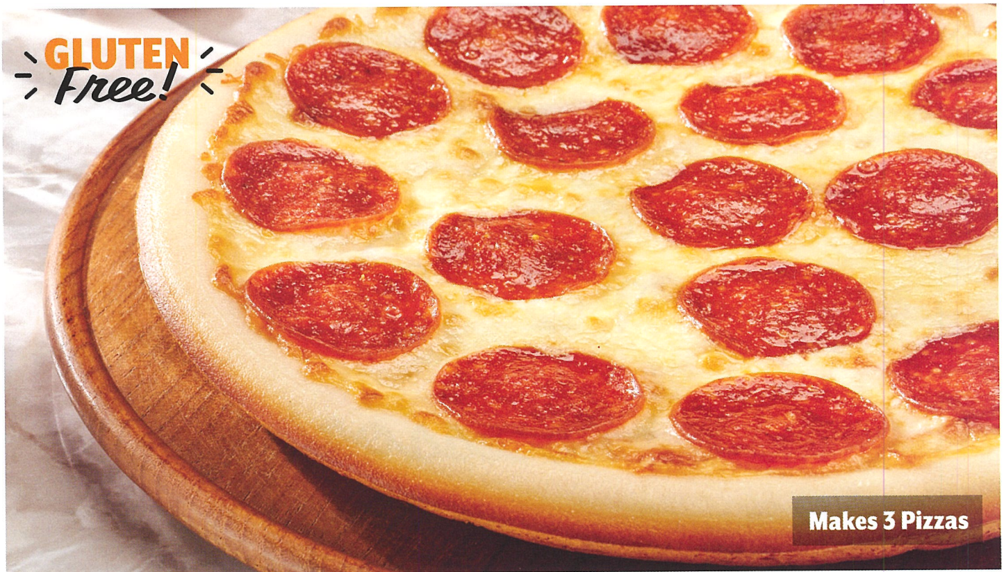
Makes 3 Pizzas